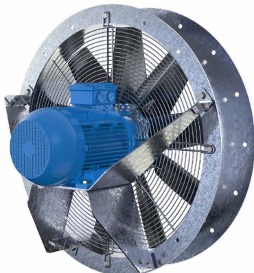
Fan for freezing