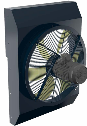
Fan for radiator applications