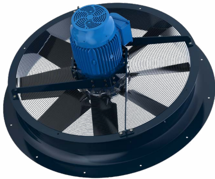
Fan for evaporators