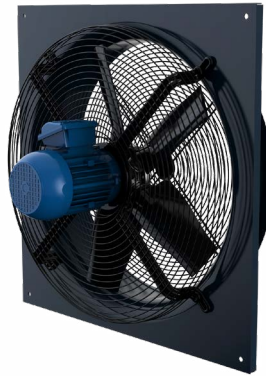
Blower fan with supported motor on flanges forming part of the protection guard