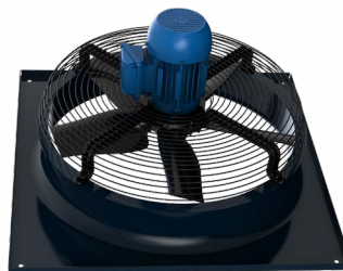
Suction fan with supported motor on flanges forming part of the protection guard