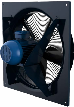
Blower fan with supported motor on legs (HEAVY DUTY)