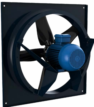
Suction fan with supported motor on legs (HEAVY DUTY).