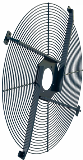
Structural guard to support flanged motors